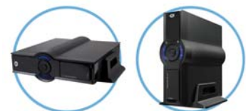
Lying or standing position

*Support for videos/movies depends on used CODECs.